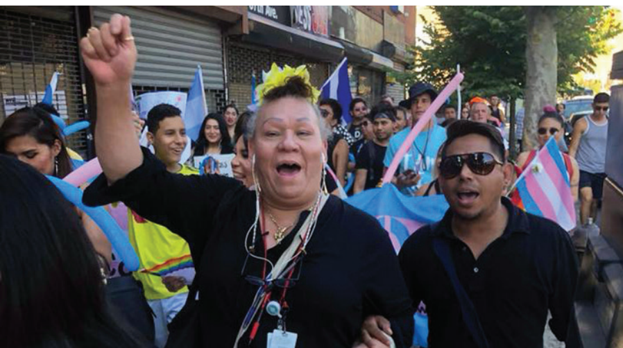
Colectivo Intercultural TRANSgrediendo, Jackson Heights, NY, 2019 TJFP Grantee