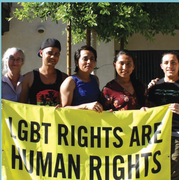
Transcend Arizona, Paradise Valley, AZ, 2019 TJFP Grantee

We've been happily functioning as a non-charitable trust for nearly four years. So far, this structure has allowed us to move money quickly and with as little red tape as possible to our grantees, while also making sure that the way we operate meets the needs of our community.