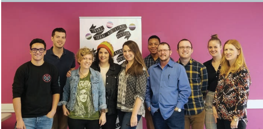
Trans Legal Aid Clinic, Houston, TX, 2019 TJFP Grantee

on knowing which seedlings hold promise and invest in those we think will grow tall over time. Eventually, if a group is successful, they will expand, hiring part-time and then later full-time staff. They will incorporate as their own non-profit and begin to broaden their scope, moving beyond local issues to state, national, or even global work. At last, what started out as just a seedling has grown into a tall, strong tree with an impeccable reputation, a broad vantage point,