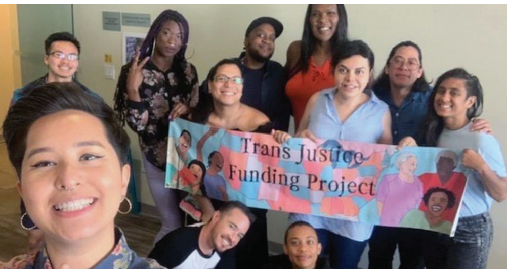
2019 TJFP Grantmaking Fellows, facilitators, coordinators and staff