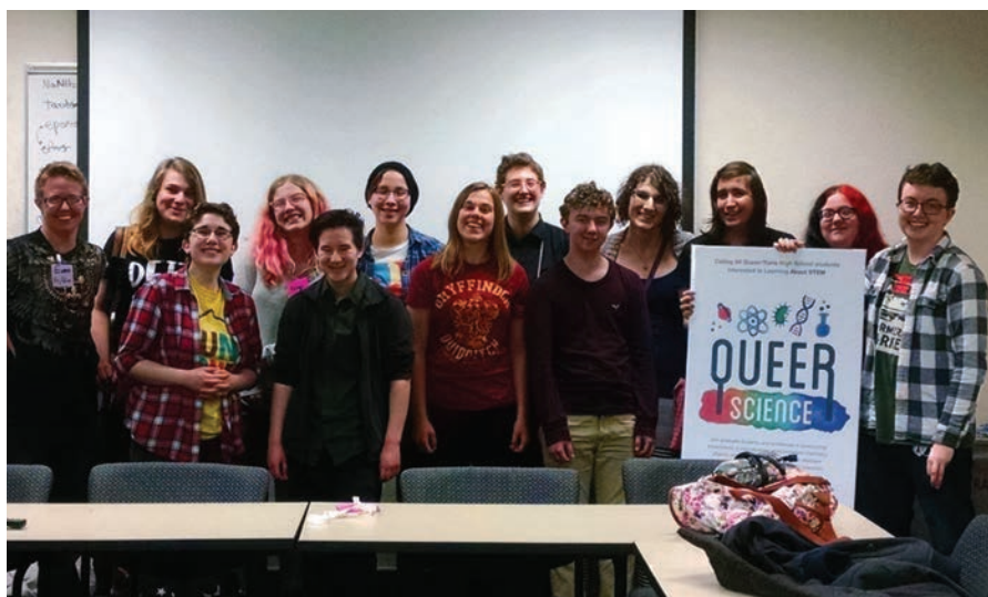
Queer Science, Minneapolis, MN, 2019 TJFP Grantee

Our Spot KC (Kansas City) provides resources, programming, events, leadership development, and outreach to marginalized communities within the LGBTQ+ spectrum.