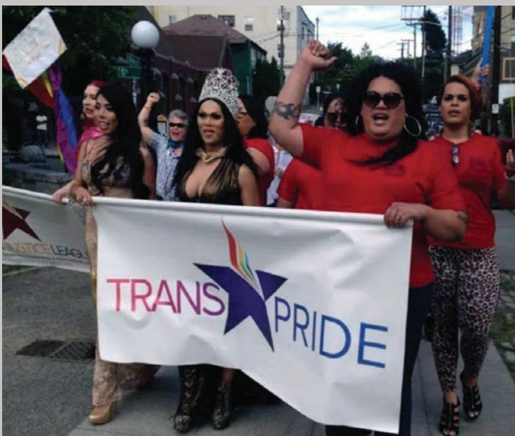
UTOPIA, Kent, WA, 2019 TJFP Grantee

The 241 applications we received this year offered us 241 narratives of a trans justice movement.