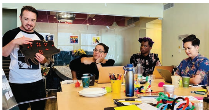
TJFP grantmaking meeting

While TJFP knows we always have room for improvement in our process, several of our Fellows described their experience as "life changing" and "transformative." It was a mutual feeling, as the TJFP team was also moved by the spirit and brilliance of the talented Fellows.