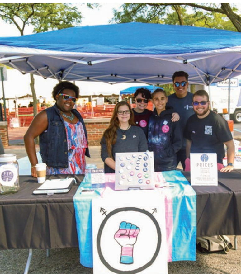
FTM A2 Ypsi, Ypsilanti, MI, 2019 TJFP Grantee

Let me say first that I'm not proposing chopping down anyone's tree. Large organizations, as long as they are truly accountable to the communities they serve, provide stability, reliable services, organizing know-how, and inspiration. There should be funding for them. There should be big, multi-year grants with simple application requirements that don't require a full-time development staff to complete. But our focus on trees has meant that we've missed the bigger picture. Social justice movements are not just the story of the trees. They are the story of the grass.