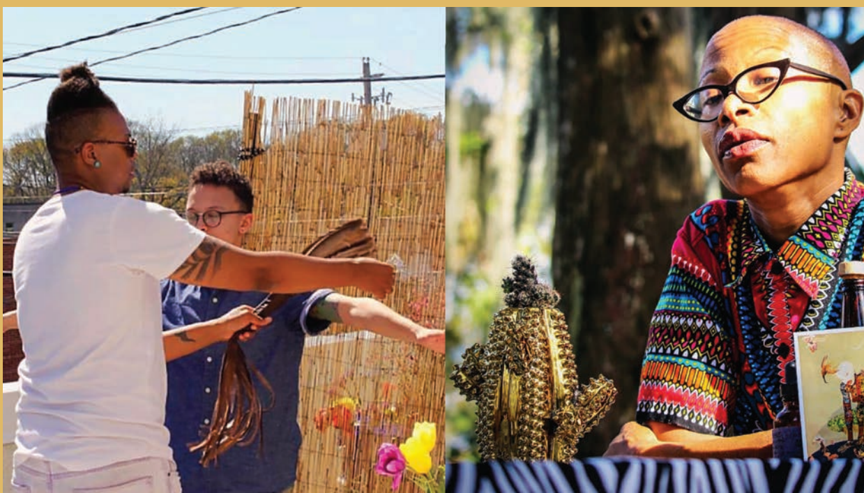
Deep South Wellness Project, New Orleans, LA, 2019 TJFP Grantee

We center the leadership of trans people organizing around their experiences with racism, economic injustice, transmisogyny, ableism, immigration, incarceration, and other intersecting oppressions.