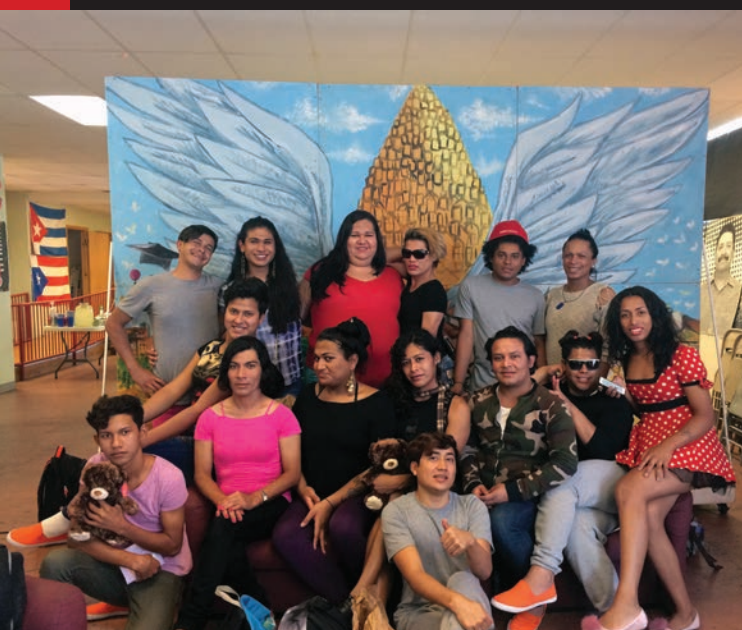
Trans Liberation Coalition, Albuquerque, NM, 2019 TJFP Grantee

There's simply not enough money for radical grassroots trans leadership and we do feel like we need to protect what little there is to ensure it goes directly to those most affected and impacted by oppression. As it is, a very small percentage of all philanthropic dollars fund trans-led groups fighting for trans justice, and even less is directed to trans-led groups led by people of color and groups with no nonprofit status. In fact, according to the 2016 Tracking Report by Funders for LGBTQ Issues, for every $100 given by foundations in the U.S., about 3 cents goes towards trans communities. (according to the 2018 infographic "Foundation Funding for U.S. Trans Communities," produced