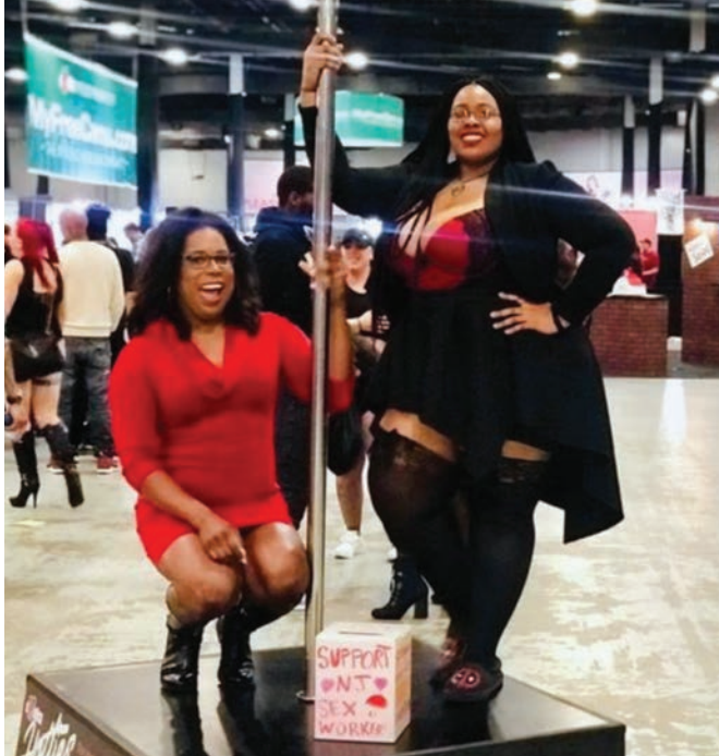
New Jersey Red Umbrella Alliance, Long Branch, NJ, 2019 TJFP Grantee

At the core of this vision is a world where trans, non-binary, and gender non-conforming (GNC) communities are safe, liberated, and resilient. In our vision, trans, non-binary, and GNC communities have abundant resources, and boundless personal and political power, so that TJFP no longer needs to exist. In this world, trans people are free and able to grow in truth and power, our elders are safe, and we live in interdependent and intergenerational communities of care. Ten years from now, if not sooner, this is where we hope to be.