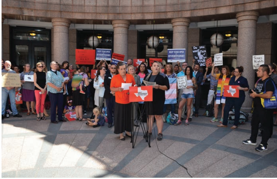
Latinas Trans Austin, Austin, TX, 2019 TJFP Grantee

Gender Benders (Piedmont) is a grassroots organization that connects trans, gender non-conforming, and allied individuals in the South to resources, provides support and advocacy, and initiates trans-inclusive community change.