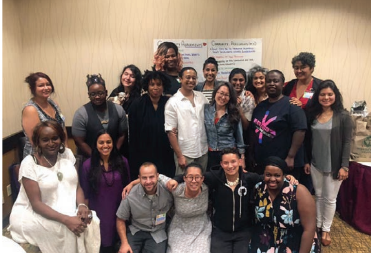
Left: #StillHere Collective, Sacramento, CA, 2019 TJFP Grantee; right: Mirror Memoirs, Los Angeles, CA, 2019 TJFP Grantee