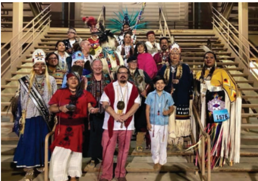
SW Two Spirit Society, Albuquerque, NM, 2019 TJFP Grantee

Life) (Bronx) assists affirmed men and women with necessary life skills, medical needs, counseling, and access to the resources needed to improve their quality of life.