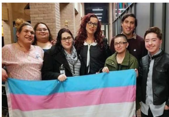
Left: Upswing Advocates, Chicago, IL, 2019 TJFP Grantee; right: GenTex, Mcallen, TX, 2019 TJFP Grantee