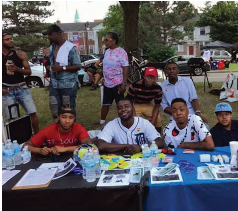
Nuui Waav Brotherhood, Detroit, MI, 2019 TJFP Grantee

I don't know exactly what's keeping everyone together other than the little moments of visibility we can jump onto. I think specifically that Pose and the Pose stars have shifted conversations for some folks. The show has given trans people visibility and a feeling of connection to folks who are seemingly living