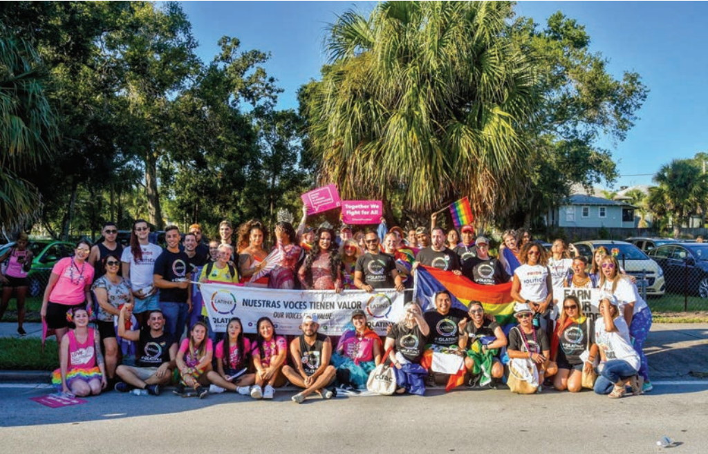
QLatinx, Orlando, FL, 2019 TJFP Grantee

Rooted Resistance (Tallahassee) is committed to creating socially-just wellness environments for trans, queer, gender non-conforming, non-binary, and the gender-queer community.