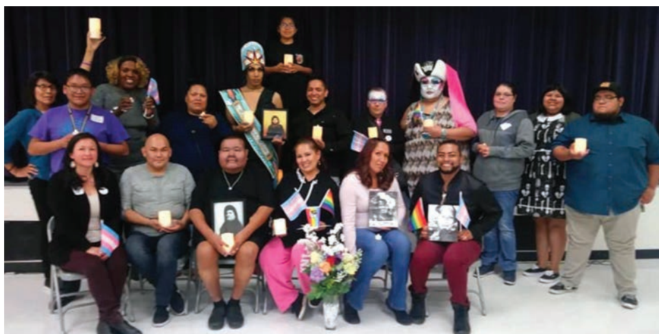
Native Trans Support Team of Arizona, Tucson, AZ, 2019 TJFP Grantee

inTRANSitive (Little Rock) seeks to support, educate and celebrate the Trans community and its narratives in Arkansas, through community building, organizing, and political education.