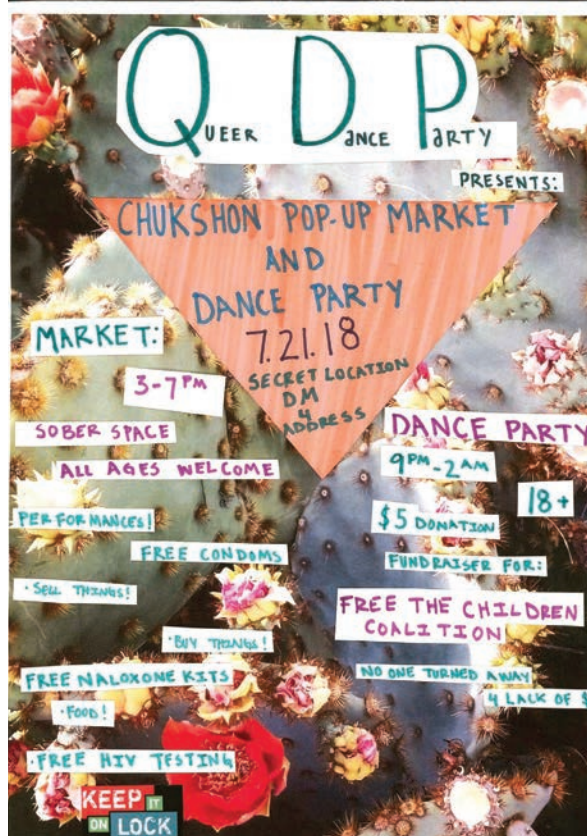
Chukson Healing Market, Tucson, AZ, 2019 TJFP Grantee

Giving money should be more intentional. Because of our different relationships to money and the different ways we learn to talk about and relate to money, awarding grants should be coupled with optional training around money management with a social justice framework, to equip folks who are getting that money. So many of these things are not actually taught in a course-specific way. You either come into this knowledge