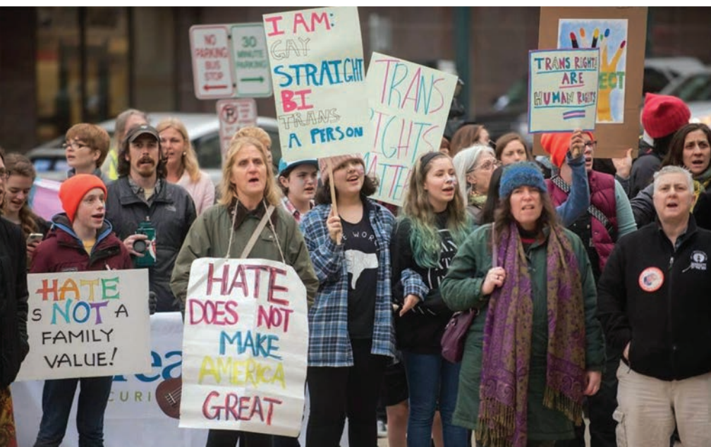
Maine Trans Network, Portland, ME, 2019 TJFP Grantee

LOUD (New Orleans) is a radical trans and queer youth theater company utilizing theater-making to fight oppression, build youth leadership, and increase LGBTQ youth wellness.