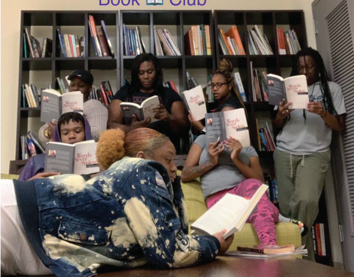
Bridging the Gap, Ft. Lauderdale, FL, 2019 TJFP Grantee

Seventy-four percent of our grantees had a budget of less than $50,000; 61 percent had a budget under $25,000; and 33 percent had a budget below $5,000. Many of those had no budget at all. All the work, play, creativity, and time that make all this meaningful work flourish and grow across the country amazes us!