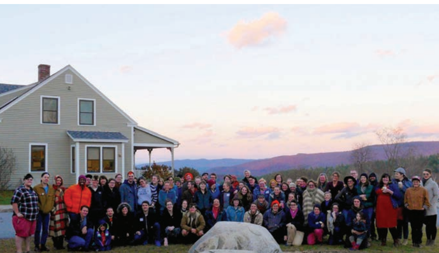
Green Mountain Crossroads Brattleboro, VT, 2019 TJFP Grantee

Trans Women of Color Collective works to uplift the narratives, leadership, and lived experiences of trans and GNC POC through healing, advocacy, and art, while building toward the collective liberation of all oppressed people.