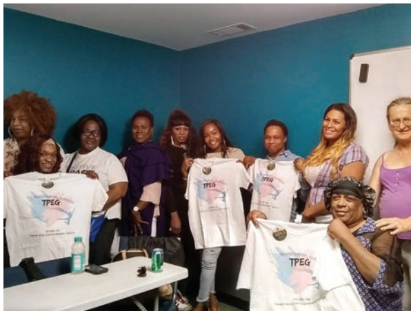
Left to right starting from preceding page, 2019 TJFP Grantees: New Legacy, New Orleans, LA; Nationz Foundation, Richmond, VA; Minority Transgender Unity, Norfolk, VA; TAKE, Birmingham, AL; Transcending Barriers, Atlanta, GA