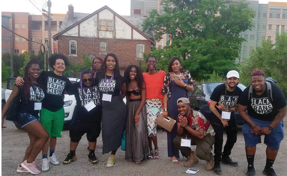
Black Trans Media, Brooklyn, NY, 2019 TJFP Grantee

by Funders for LGBTQ Issues and Grantmakers United for Trans Communities).