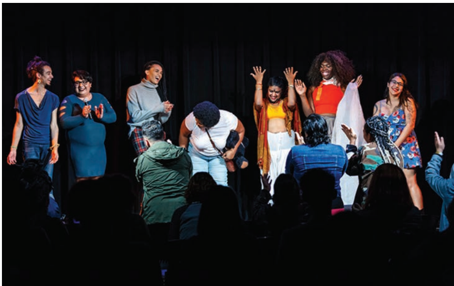
Peacock Rebellion, Oakland, CA, 2019 TJFP Grantee

Q Latinx (Orlando) is a grassroots racial, social, and gender justice organization dedicated to the advancement and empowerment of Central Florida's LGBTQ+ Latinx community.