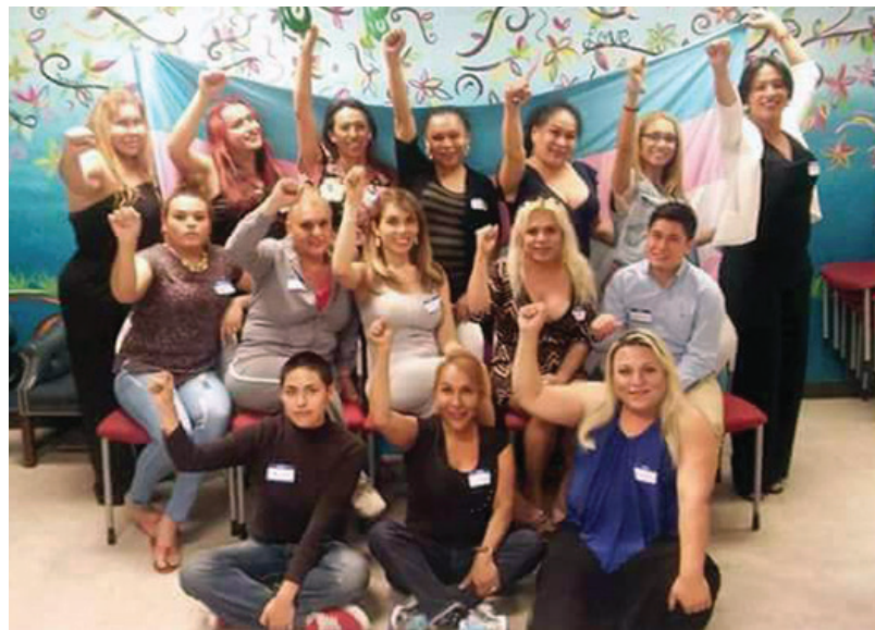
Latinas Trans Dallas, Dallas, TX, 2019 TJFP Grantee

In a grassroots theory of funding, this money, like the sun, like the rain, already belongs to the communities a funder serves; already belongs to all those who, through their organizing, service, time, love, and sacrifice, are making change happen. A grassroots funder’s job is only to gather as many resources as possible and then distribute them to as many groups as possible. To honor and amplify the work those groups are doing. And to tread very, very lightly so that the grass can grow.