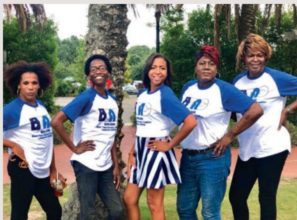
Black Transwomen Inc., Carrollton, TX, 2019 TJFP Grantee

All grantees are small organizations with budgets ranging from zero to $250,000. This year, 33 percent of grantees were 501(c)(3) non-profits, 33 percent percent had fiscal sponsors, and 34 percent had no non-profit status at all. This range of fiscal status shows us that we are meeting our goal of funding groups organizing in whatever ways work best for their communities.