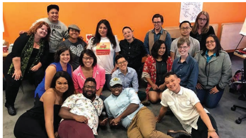
Left: Trans Lab, New York, NY, 2019 TJFP Grantee; right: Gender Justice LA and Friends, Los Angeles, CA, 2019 TJFP Grantee