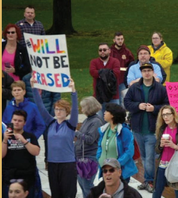
TGI Network RI, Providence, RI, 2019 TJFP Grantee

Not everyone uses the same political language to describe their work—or to describe themselves. A lot of things factor into the way a grant application reads, including where the writer is from, their communities, their class and education background, and their experiences