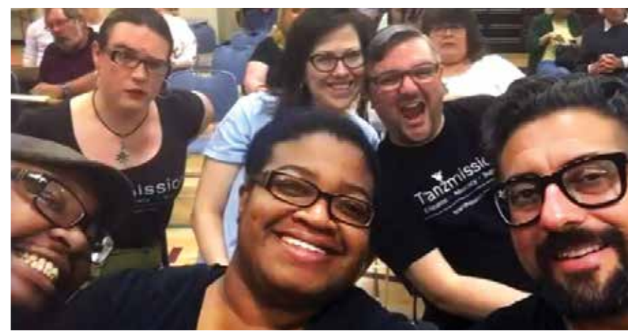
Left: UTOPIA Seattle, Seattle, WA; right: TranzMission, Asheville, NC; 2018 TJFP Grantees